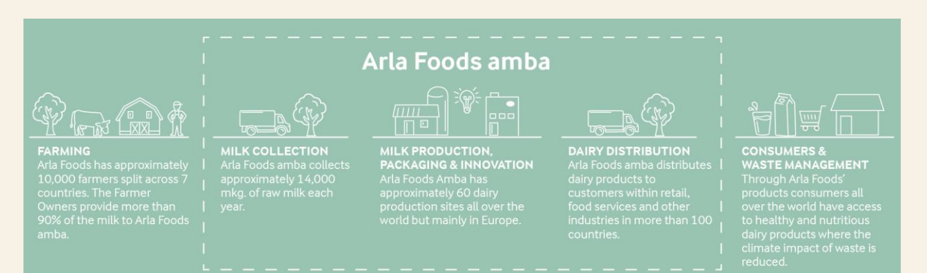
Figure 1 - Arla Foods value chain

In addition to the investments made within Arla Foods amba to continuously improve its sustainability performance, investments are also made to improve both the up- and down-stream impact. These initiatives are focused internally as well as with suppliers and the end consumers. The focus is on the overall climate impact and on recyclability and reduction of waste, including food waste.